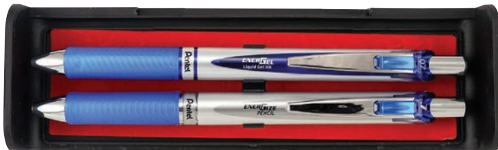
ITEM: BL77N-CI- PEN BARREL/TRIM: ● Silver Tone / ● Blue INK: ● Blue PL77NCI- PENCIL