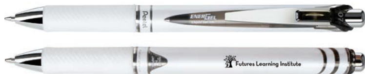
ITEM: BL77PW-AI BARREL/TRIM: ○ Pearl Tone / ● Black INK: ● Black