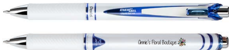
ITEM: BL77PW-CI BARREL/TRIM: ○ Pearl Tone / ● Blue INK: ● Blue