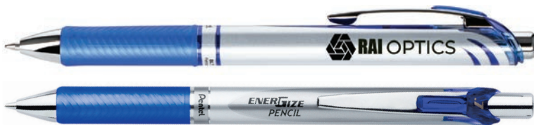
ITEM: BL77NC-AI- PEN BARREL/TRIM: ● Silver Tone / ● Blue INK: ● Black PL77NCI- PENCIL