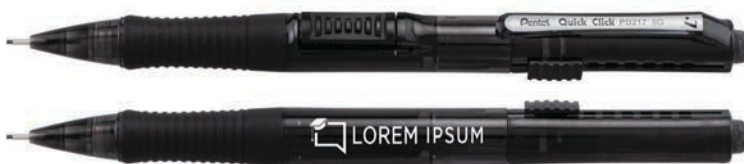
ITEM: PD217AAI BARREL/TRIM: ●Black/●Black Lead Size:0.7mm