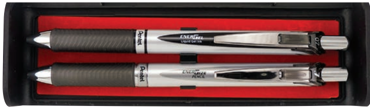
ITEM: BL77N-AI- PEN BARREL/TRIM: ● Silver Tone / ● Black INK: ● Black PL77NAI- PENCIL