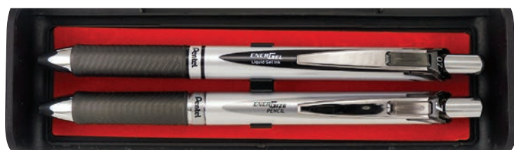
ITEM: BL77N-AI- PEN BARREL/TRIM: ● Silver Tone / ● Black INK: ● Black PL77NAI- PENCIL