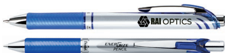
ITEM: BL77NC-AI- PEN BARREL/TRIM: ● Silver Tone / ● Blue INK: ● Black PL77NCI- PENCIL