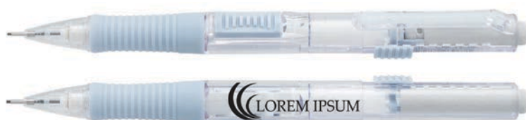
ITEM: PD217NI BARREL/TRIM: ○Clear/●Grey Lead Size:0.7mm