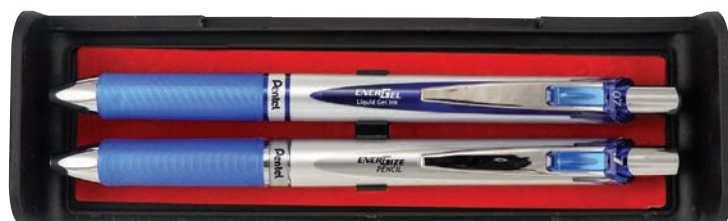
ITEM: BL77N-CI- PEN BARREL/TRIM: ● Silver Tone / ● Blue INK: ● Blue PL77NCI- PENCIL