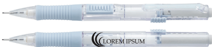
ITEM: PD217NI BARREL/TRIM: ○ Clear/● Grey Lead Size: 0.7mm