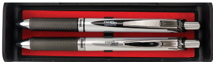
ITEM: BL77N-AI- PEN BARREL/TRIM: ● Silver Tone / ● Black INK: ● Black PL77NAI- PENCIL