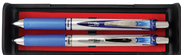
ITEM: BL77N-CI- PEN BARREL/TRIM: ● Silver Tone / ● Blue INK: ● Blue PL77NCI- PENCIL