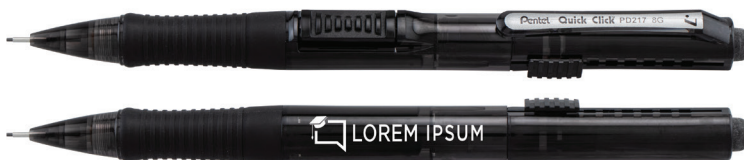
ITEM: PD217AAI BARREL/TRIM: ● Black/● Black Lead Size: 0.7mm