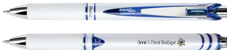
ITEM: BL77PW-CI BARREL/TRIM: ○ Pearl Tone / ● Blue INK: ● Blue