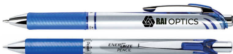
ITEM: BL77NC-AI- PEN BARREL/TRIM: ● Silver Tone / ● Blue INK: ● Black PL77NCI- PENCIL