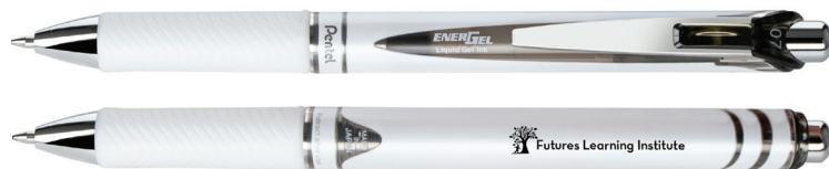
ITEM: BL77PW-AI BARREL/TRIM: ○ Pearl Tone / ● Black INK: ● Black